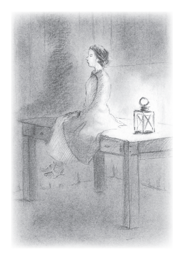
Illustration © 2014 by Matt Phelan

Correlates to Common Core Language Arts Standards in Reading: Literature: Key Ideas and Details RL. 3-5.1, 4–5.2, 3–5.3; Reading: Craft and Structure RL. 3–5.4, 3–5.5; Reading: Integration of Knowledge and Ideas RL. 3–5.7; Language: Conventions of Standard English L. 3–5.1; Language: Knowledge of Language L. 3–5.3, 3–5.4; Speaking & Listening: Comprehension and Collaboration SL. 3-5.1, 3–5.2, 3–5.3; Speaking and Listening: Presentation of Knowledge and Ideas SL. 3-5.4, 3-5.6.