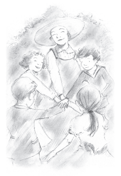
Illustration © 2014 by Matt Phelan

Correlates to Common Core Language Arts Standards in Reading: Literature: Key Ideas and Details RL. 3–5.1; Reading: Craft and Structure RL. 3–5.4; Writing: Text Types and Purposes W. 3–5.2.