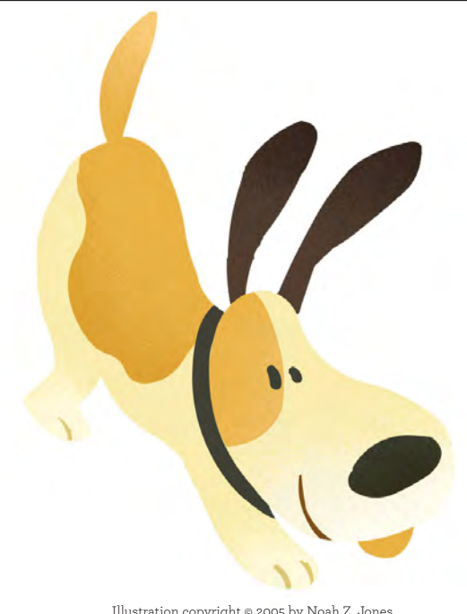
Illustration copyright \circledcirc 2005 by Noah Z. Jones.