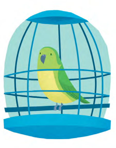
Illustration copyright © 2005 by Noah Z. Jones.