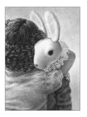
The rabbit's name was Edward Tulane, and he was tall. He measured almost three feet from the tip of his ears to the tip of his feet; his eyes were painted a penetrating and intelligent blue.