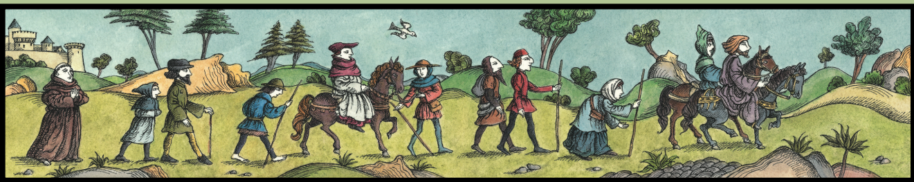
ILLUSTRATIONS COPYRIGHT © 2007 BY ROBERT BYRD