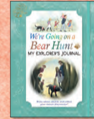
My Explorer's Journal HC: 978-0-7636-9842-3