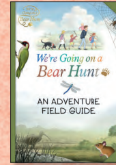
An Adventure Field Guide Flexiback: 978-0-7636-9843-0