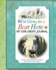
My Explorer's Journal HC: 978-0-7636-9842-3