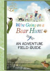
An Adventure Field Guide Flexiback: 978-0-7636-9843-0